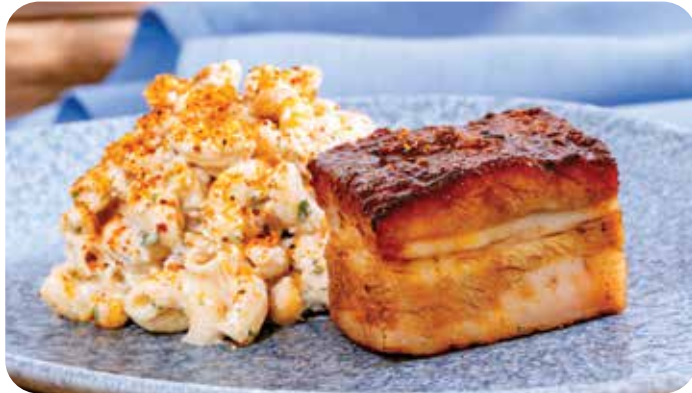
CARNITAS-STYLE PORK BELLY AT LA STYLE MARKETPLACE

Love chicken wings? Adore pizza? Enjoy the best of both tastes with fried chicken wings dipped in cheese pizza-flavoring and seasoning. Try them with Really Ranch Dip featuring Spiceology® Spices. That's something to cluck about!