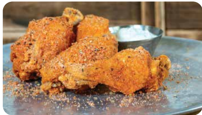
CHEESE PIZZA-FLAVORED WINGS AT CLUCK-A-DOODLE-MOO MARKETPLACE

Take advantage of the Festival Sip and Savor Pass that lets you sample food and non-alcoholic drinks from the festival marketplaces and other locations throughout Disney California Adventure ® Park. Cardmembers can redeem their Disney Rewards Dollars toward purchasing the Pass. 5 Visit Disneyland.com/SipandSavor for more information.