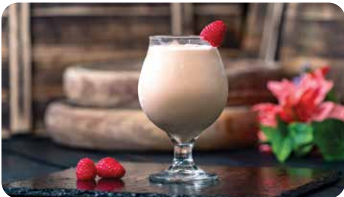
PB&J WHISKEY SHAKE AT THE NUTS ABOUT CHEESE MARKETPLACE

Satisfy your sweet tooth with a graham cracker tart shell filled with caramel, chocolate cake and milk and dark chocolate ganache, topped with a toasted marshmallow. You'll definitely want S'more!