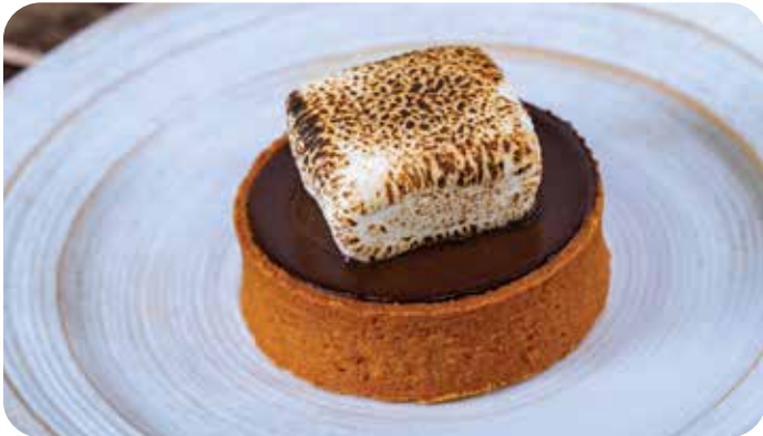
S'MORES CARAMEL TART AT GOLDEN DREAMS MARKETPLACE

Not your traditional macaroni salad! Pork belly is combined with macaroni, esquites corn and Tajín® mayo, then sprinkled with Tajín® Habanero seasoning. One bite will have you going back for seconds—or thirds!